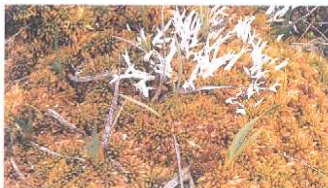
Sphagnum mosses begin to dominate the wet areas on the bogs and active peat formation will be restored over time.

The main objective of this four year project, finishing September 2008, is the restoration of 571 hectares of raised bog, spread across the Midlands of Ireland, to more favourable conservation status.